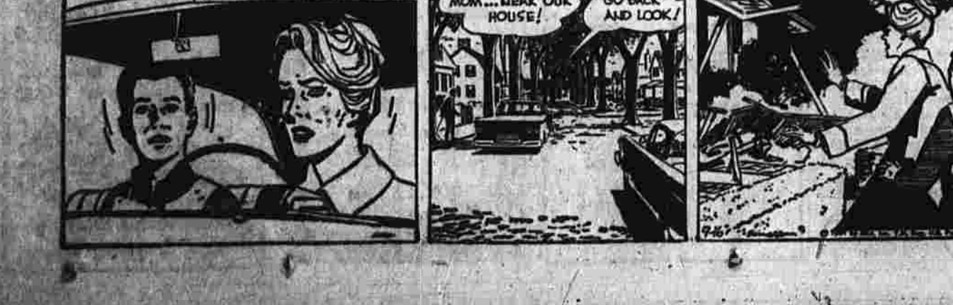
THE STORY OF MARTHA WAYNE