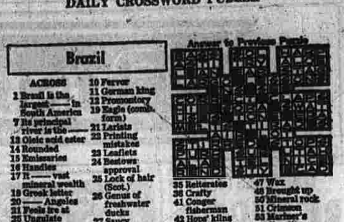
DAILY CROSSWORD PUZZLE