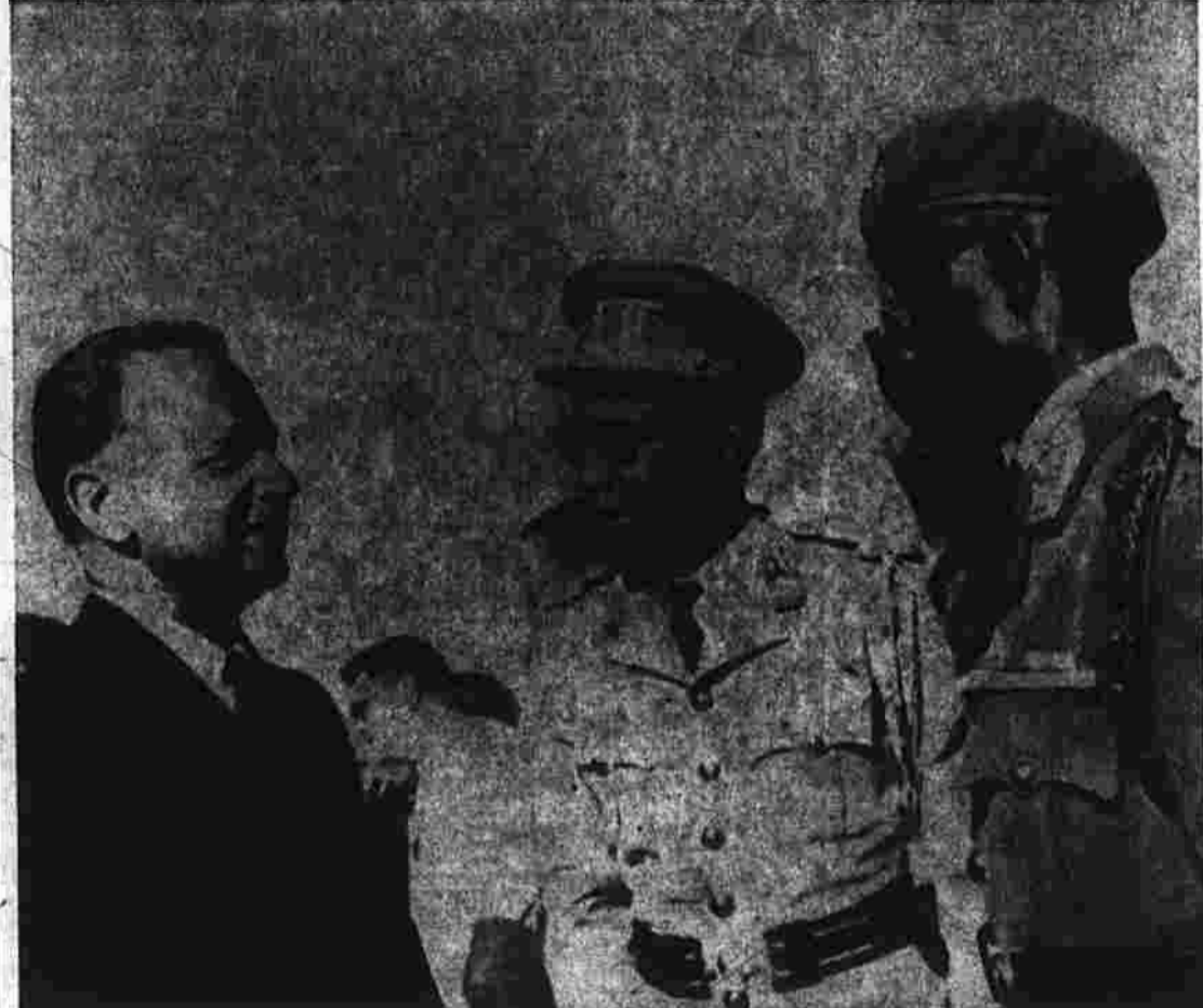
This is the most recent photograph of Dag Hammarskjold, United Nations secretary-general, taken when he was greeted by Congolese military leader Gen. Joseph Mobutu, center, and saluting Congo officer, when Hammarskjold arrived in Leopoldville last week.